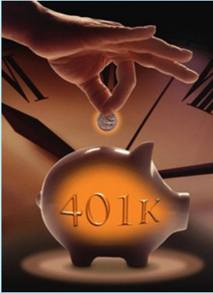
A number of retirement plan and IRA limits are indexed for inflation each year. Many of the limits have increased for 2012.

Many retirement plan and IRA limits are indexed for inflation each year. Some of the key numbers for 2012 are discussed below.